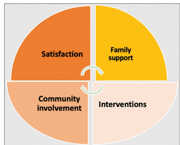
Figure 3: Triangulation of the themes

In some of the PD families, fathers and grandparents also shared responsibility in taking care of the underfive