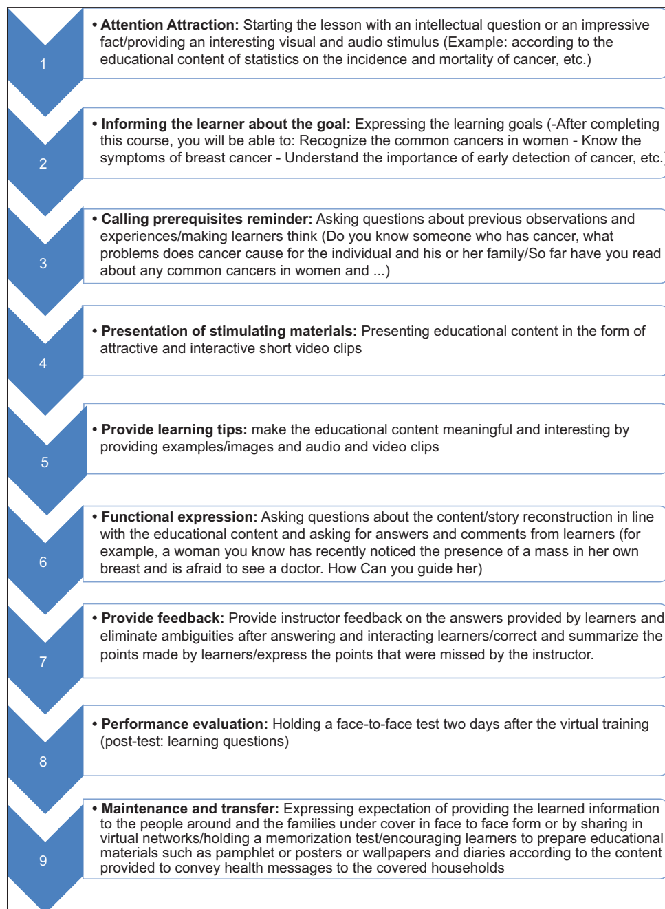
Figure 2: Gagne 9-step instructional events model

Content validity of questionnaires confirmed after the design by calculating the content validity index (CVI), and content validity ratio (CVR) was reviewed and approved by eight experts. The CVR score for all items was higher than 0.75, and the CVI score was higher than 0.8 after modifying some items. Test-retest method was used to determine the reliability of the knowledge section questionnaire on 30 health volunteers with 2 weeks interval. The correlation coefficient between the two-stage results was 0.79.