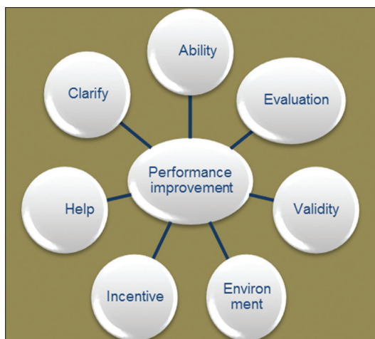
Figure 1: The variables of achieve model